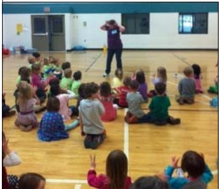
Over 100 children participated in an exercise class for WOYC in Teton County.