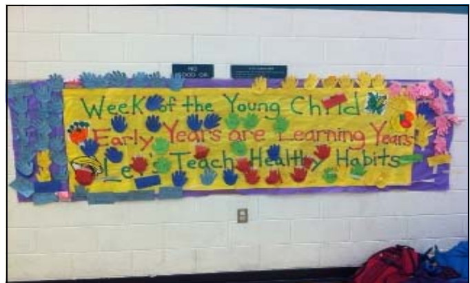
WOYC sign made by the children attending the event in Jackson.